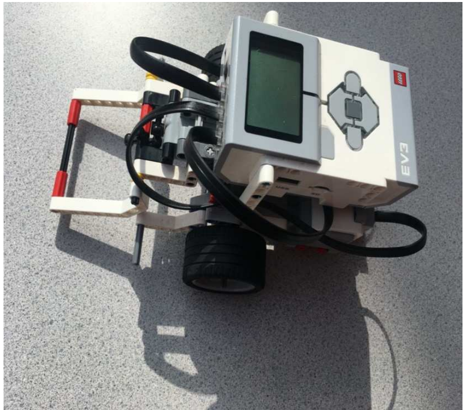
Figure 2 Pre-Built Rover

The next phase of the enrichment program involved a pre-built rover (see Figure 2) that included an arm that can be raised and lowered. In addition, students were given a touch sensor and connection cables to be able to further expand the robot. Students were instructed on what each of the motors could do, and the basics of how to use the Lego program and import the program into the Lego Mindstorm brick, or robotic brain, to be run. Students were given the task to discover how to connect the robots to their chromebooks via Bluetooth, which they eagerly did and shared with one another. Students were then given 12 challenges that they moved through at their own pace. At the start of each class meeting, students reported on which challenge they were working, and students were allowed to ask each other how they were able to